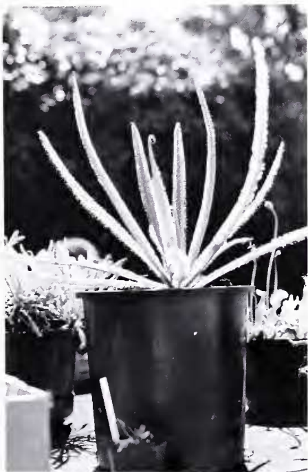
Drosera regia growing in a one gallon container at the Northern California CP meeting. See News & Views page 37.

The bottom line is, WIP is advancing to a new level in evolution. What more can I say?